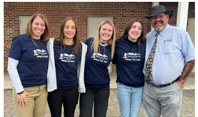
GEAR UP Maine Rise students during the 2025 Fall bus tours of College Campuses throughout the state.

On the cover: Students from across the state engaging in various activities: the TRIO alum recognition celebration at USM, UB students from UMF in attendance at the New England Student Leadership Conference in Vermont, UB students from UMPI visiting UNH, TRIO and GEAR UP Advocacy Day 2025 at the Statehouse, and the 2024 Johnson Scholars graduates.